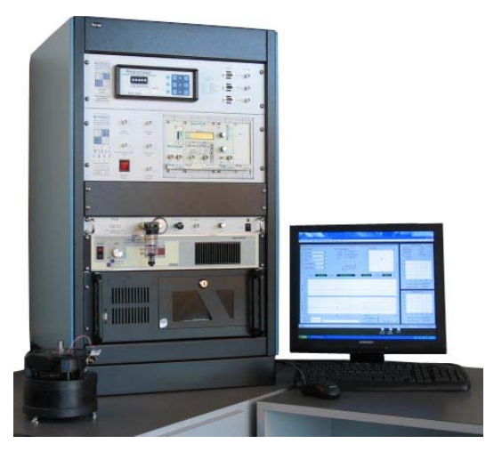
9155 system shown with Rack Integration option (9155D-100), Signal Conditioning options (9155D-443, -445, -478) and Air-bearing Shaker System (9155D-830)

The Accelerometer Calibration Workstation Model 9155 features accurate back-to-back comparison calibration of ICP® (IEPE), and charge mode piezoelectric accelerometers in accordance with ISO 16063-21 (2003). The 9155 system can also calibrate piezoresistive, capacitive, and velocity sensors via available options. Other configurations offer automated TEDS sensor updating, linearity checking, low frequency calibration down to 0.1 Hz, shock calibration, and a host of shaker options.