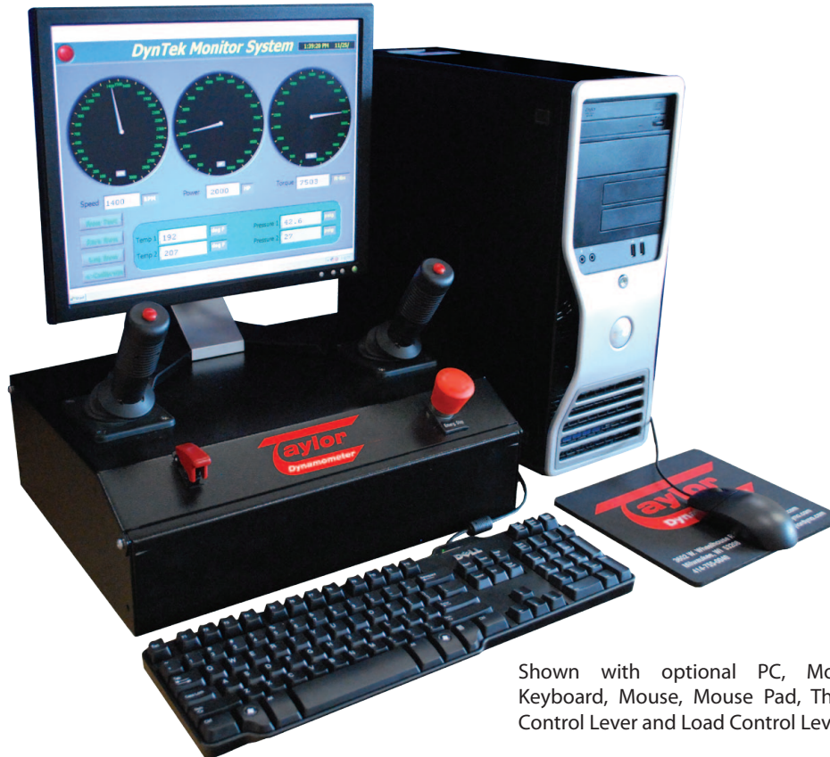
Shown with optional PC, Monitor, Keyboard, Mouse, Mouse Pad, Throttle Control Lever and Load Control Lever.

The DynTek-PC 2+2 engine dynamometer instrumentation system is a display only system intended for the most basic engine dynamometer testing requirements. This system provides for the measurement of torque in either tension or compression (both clockwise and counter-clockwise engine rotation), speed from a standard Magnetic Pickup along with two pressure and two temperature measurements.